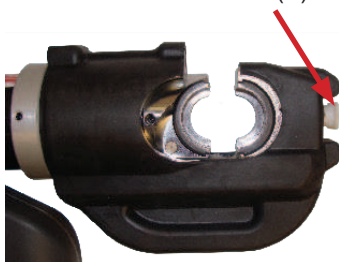
Head with Dies