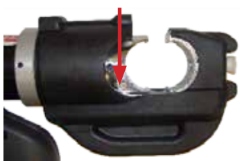
Head without Dies