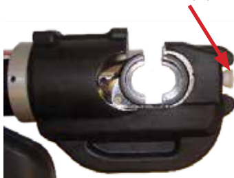
Head with Dies